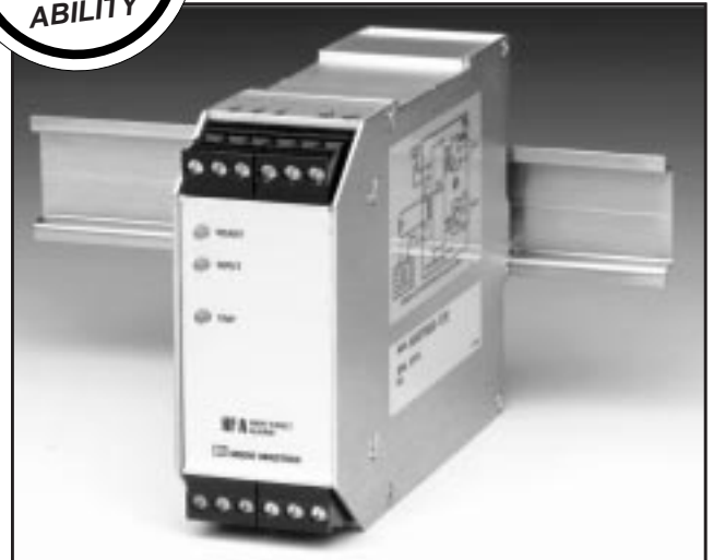
The HFA HART Fault Alarm is like having a field technician watch your important smart HART instrument loops 24-hours-a-day.

Our HFA is like having a field technician watch the performance of your HART instrument 24-hours-a-day. Installed “transparently” on to a point-to-point temperature, pressure, level, or flow HART (4-20mA) transmitter loop, the HFA continually “reads” the HART digital diagnostic messages that continuously ride on the 4-20mA loop. If the process sensor input, the analog output, or the HART transmitter is not behaving properly, the HFA sends an instrument fault (contact closure) alarm to let you know. It will help you identify a potential problem before a shut-down happens. See the back page for details on configurable alarm trip options.